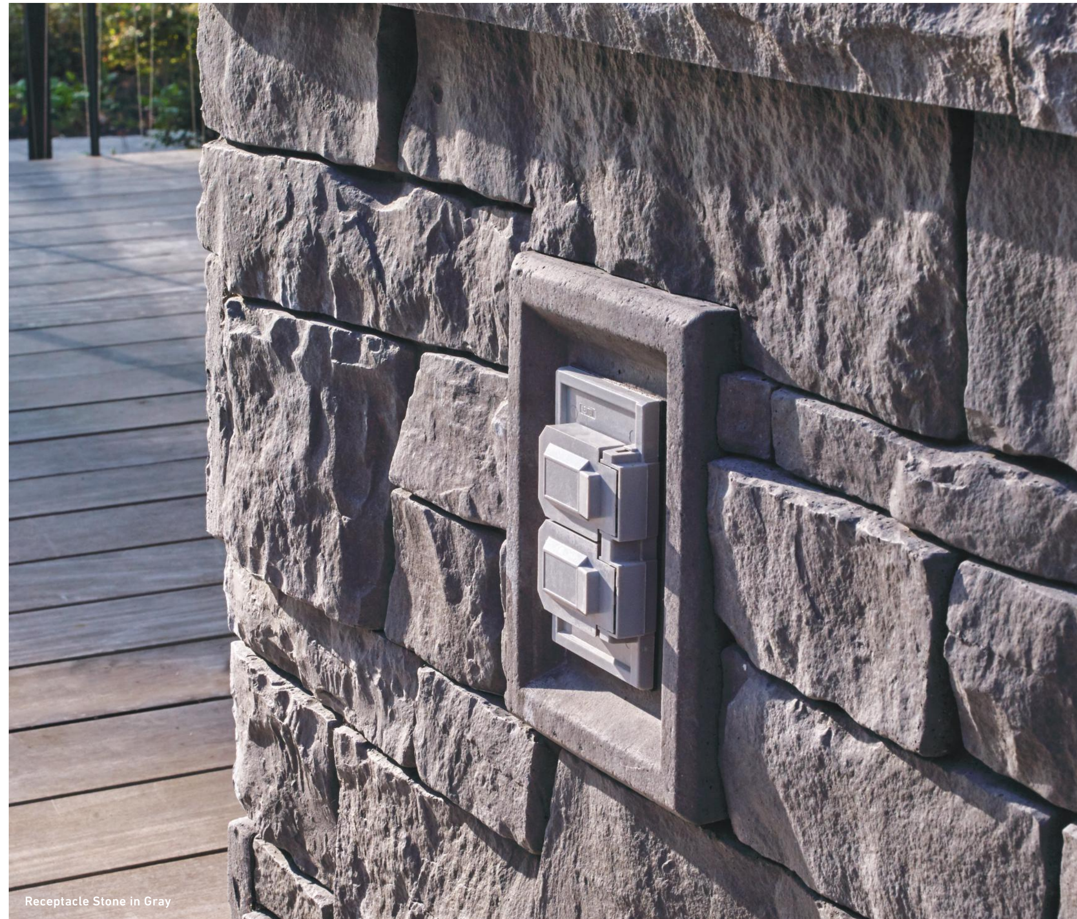
Receptacle Stone in Gray