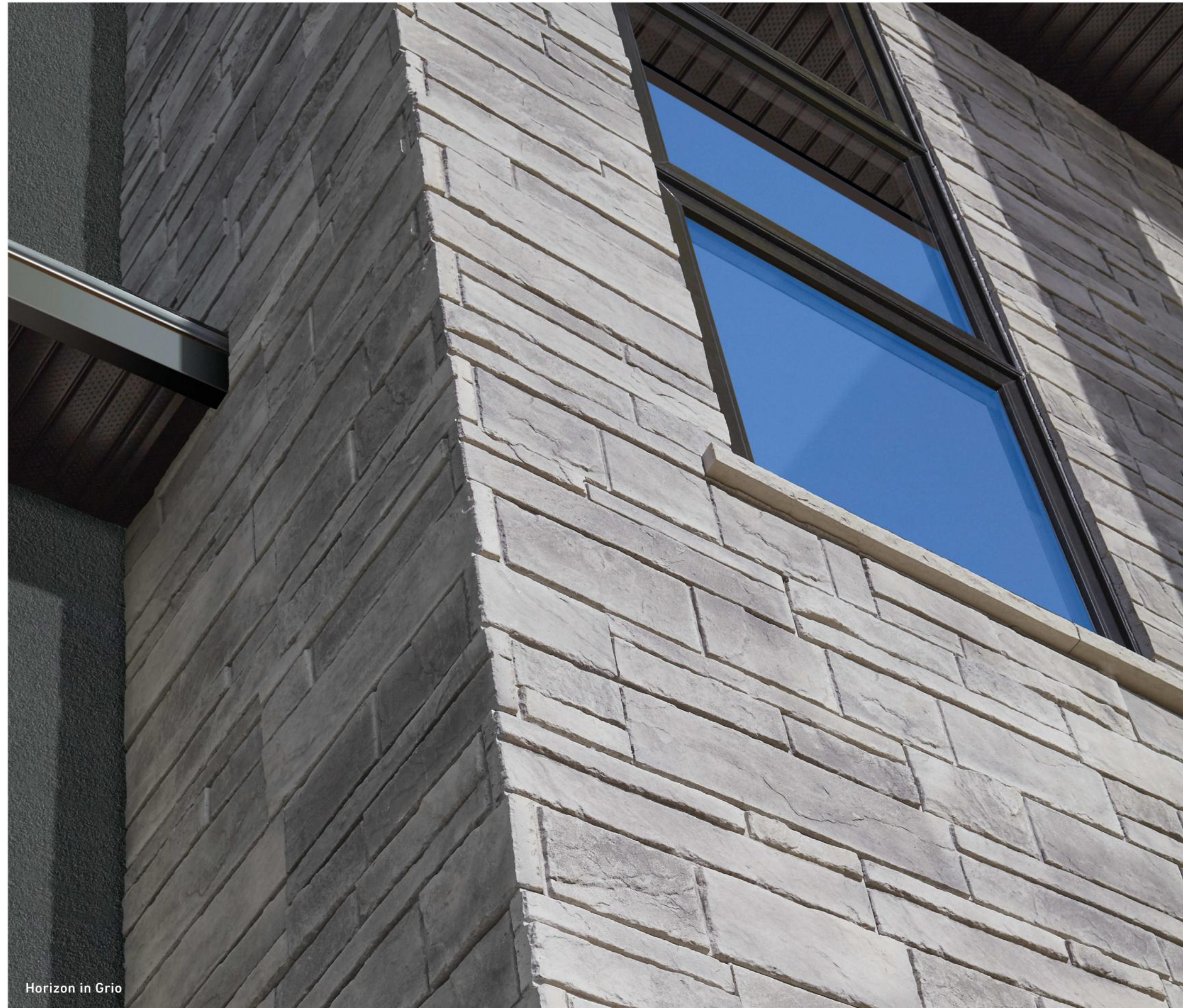
Horizon in Grio